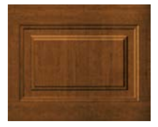
Classic Medium Finish